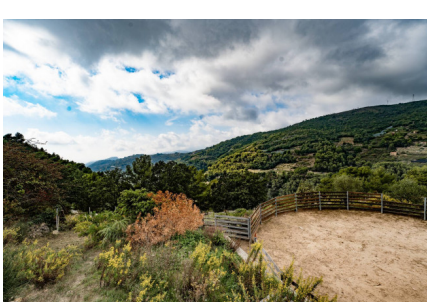
RIF. 13821 - PRICE: € 160.000 - MQ 160

Seborga, in an extremely private and independent position we offer for sale the building land with the possibility of building the villa of about 160 square meters (residential and warehouse) and swimming pool, plus basement of about 150 square meters. Land of approximately 9,000 m2 (1,880 m2 around the house and 7,120 m2 for index near the property) Panoramic open view of the valleys, partially sea view. South-west exposure. A few minutes by car from the city centre of the principality of Seborga