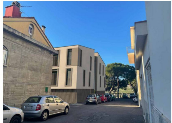
RENDER vista dell'esterno