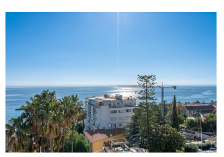
RIF. 13895 - PRICE: € 540.000 - MQ 110

Sanremo, a short distance from the beaches and in a quiet residential area, we offer for sale a bright apartment with a large terrace and a splendid sea view. The property, in good condition, consists of: entrance hall, spacious living room, eat-in kitchen, two bedrooms, two bathrooms, closet, two balconies and a terrace from which to enjoy a suggestive sea view. The heating is independent, the location is private and quiet, perfect for those who want to live a few minutes from the center without giving up tranquility