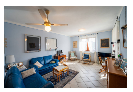
RIF. 13931 - PRICE: € 295.000 - MQ 115

In Sanremo, in a quiet and well-served residential area, we offer for sale a bright 115 m2 apartment, free upon deed and in excellent condition. Located on the second floor of a building with a lift, the property consists of 4 rooms, including 3 bedrooms and 2 bathrooms. The internal spaces are distributed in a rational way and are characterised by quality finishes and excellent brightness thanks to the large windows in each room. The apartment is fully furnished and ready to move into. The condominium fees are only 100 euros per month. The total surface area is 115 m2, of which 107 m2 are walkable, ensuring large spaces and comfortable living. The building consists of a total of 4 floors, and is equipped with a convenient elevator. Ideal for those who want a welcoming and functional